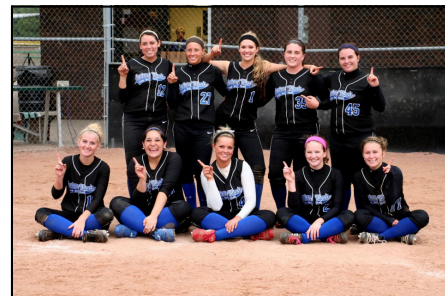
The Eastern Illinois Blue Team Celebrates after winning the EIU Fall Frenzy Championship Game 10-9 in 8 innings over Illinois State.